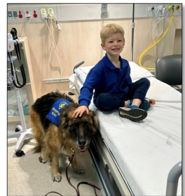
Therapy Dog Kali at Latrobe Regional Hospital's Emergency Dept